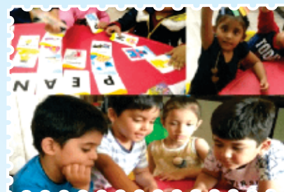
Jolly Phonic Sessions