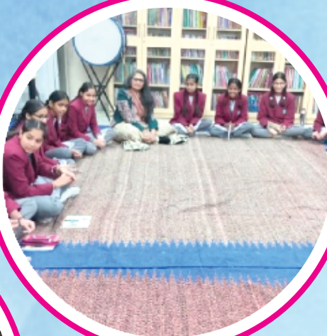
Life skills for Confident Choices