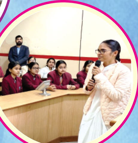
Spiritualism & Healing