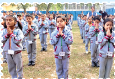
Moments of Gratitude