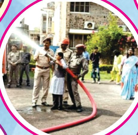
Fire Safety Drill