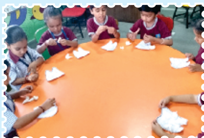
Morning & Closing Circles